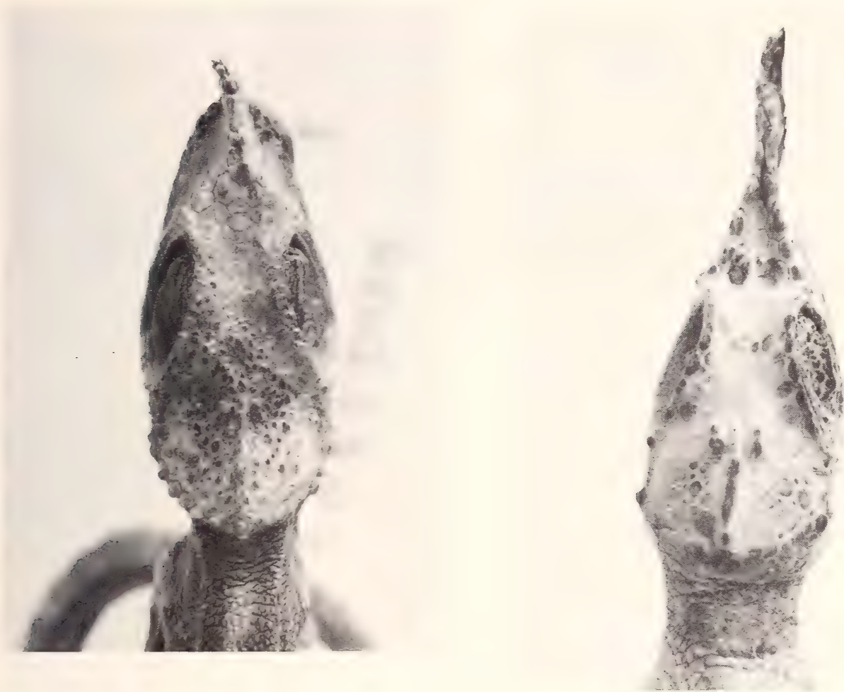
Fig. 6: Dorsal view of the head of the lectotype of B. tenue (ZMB 11348: 1, left) and the holotype of B. oxyrinum (ZFMK 46406, right).

developments in distantly related groups that evolved from the same ancestral stock. Ecology and geography: The scant field notes and records in literature report B. tenue to be captured from lowland forest (ZFMK 38677), from bushes (BMNH 1974.523 & 524), from long grass (Barbour & Loveridge, 1928) and from a forest edge habitat (Loveridge, 1939). B. oxyrinum was captured in the Mwanihana forest (ZMUC 51376). It seems that both species occur in bushes and forest patches from low to (sub-)montane elevations, viz. Shimba Hills, Usambara Mts., Uluguru Mts. and Uzungwe Mts. Barbour & Loveridge (1928) compared the herpetofaunae of the Usambara Mts. and the Uluguru Mts. and established close links between the herpetofaunae confined to these isolated mountainous regions. The present paper proves their analysis at least partly wrong as they still considered B. oxyrinum and B. tenue conspecific. B. tenue occurs in the Usambara Mts. and the Shimba Hills in the north, whereas B. oxyrinum links the Uluguru Mts. with the Uzungwe Mts. in the south. In this respect the situation in B. oxyrinum and B. tenue resembles more the one found in some African members of the gekkonid genus Cnemaspis as discussed by Perret (1986). C. barbouri from the Uluguru Mts. seems to be more closely related to C. uzungwae from the Uzungwe Mts. than either of them is to C. africanus . C. africanus is distributed in Tanga, Usambara Mts., Mt. Kilimanjaro and